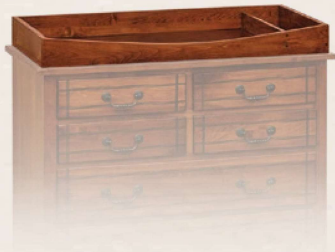
#113 · 42" Removable Changing Station Fits item #106 or #115