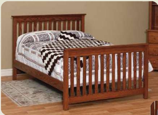
#103 - Full Sized Bed Conversion Kit Includes bed rails, slats, and hardware to easily convert crib into a full sized bed.