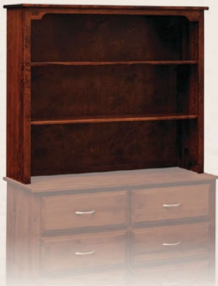
#109 · Hutch Top Fits item #105 or #107 50 1/4" x 14" d x 42 3/4" h