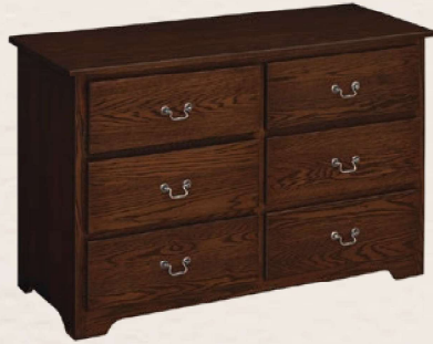
#107 SH • 6-Drawer Changing Dresser 50 \frac{1}{4} "w x 20"d x 33 \frac{1}{4} "h