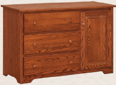
#105 SH • Changing Dresser 50 \frac{1}{4} "w x 20"d x 33 \frac{1}{4} "h