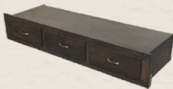
#103SR - Full Sized Bed Conversion Kit with Storage Rails Includes: (2) 3 drawer storage rails & hardware to convert crib into a full size bed. See page 16 for details.