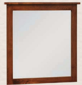
#114 · Mirror 39" w x 40 1/2" h