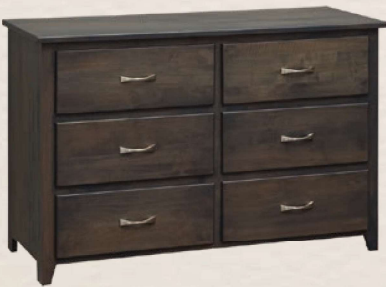
#107 ME • 6-Drawer Dresser 50 \frac{1}{4} "w x 20"d x 33"h