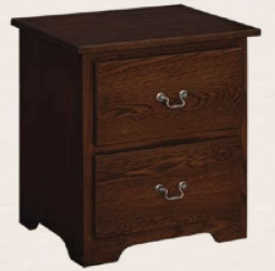
#112 SH • 2-Drawer Nightstand 24 \frac{1}{2} "w x 18"d x 25 \frac{1}{2} "h