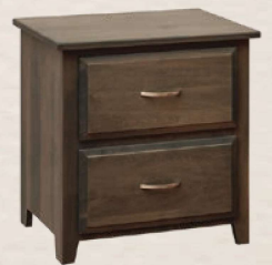
#112 HA • 2-Drawer Nightstand 24½" w x 18" d x 25½" h