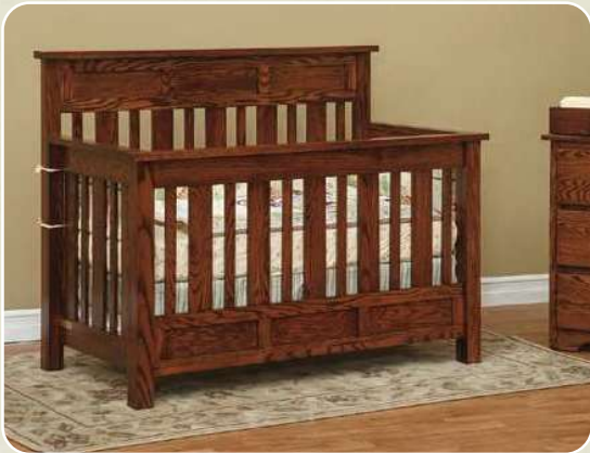
#301 - Crib 58½"w x 31¼"d x 46¼"h