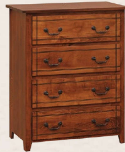
#110 MA • 4-Drawer Chest 34" w x 20" d x 42½" h