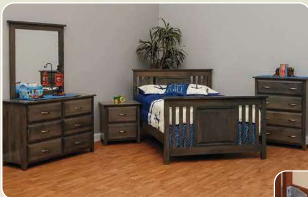
#103 - Full Sized Bed Conversion Kit Includes bed rails, slats, and hardware to easily convert crib into a full sized bed.

Ask About Our Stain Color & Hardware Choices