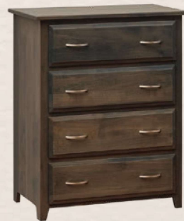
#110 HA • 4-Drawer Chest 34" w x 20" d x 42½" h