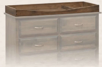
#117 · 50" Removable Changing Station Fits item #105 or #107