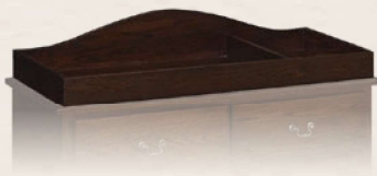
#108 · 50" Removable Changing Station Fits items #105 or #107