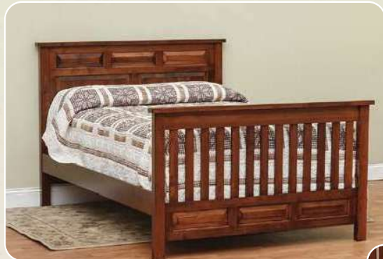
#103 - Full Sized Bed Conversion Kit Includes bed rails, slats, and hardware to easily convert crib into a full sized bed.