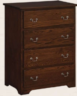
#110 SH • 4-Drawer Chest 34"w x 20"d x 42 \frac{1}{2} "h