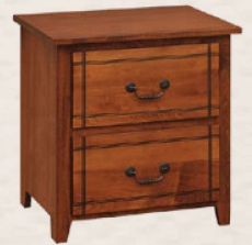
#112 MA • 2-Drawer Nightstand 24½" w x 18" d x 25½" h