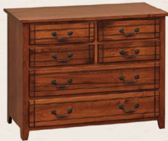
#106 MA • Changing Dresser 42" w x 20" d x 33¼" h Available in all styles