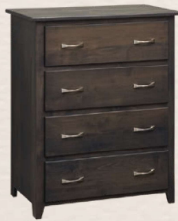
#110 ME • 4-Drawer Chest 34"w x 20"d x 42 \frac{1}{2} "h