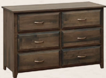
#107 HA • 6-Drawer Changing Dresser 50½" w x 20" d x 33¼" h