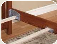
#103 - Full Sized Bed Conversion Kit Includes bed rails, slats, and hardware to easily convert crib into a full sized bed.