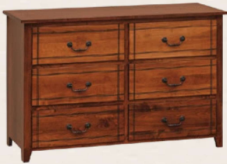
#107 MA • 6-Drawer Changing Dresser 50½" w x 20" d x 33¼" h