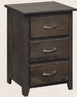
#118 ME • 3-Drawer Nightstand 20"w x 18"d x 29"h Available in all styles