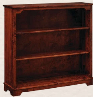
#116SH · Hutch Top with Base Fits item #105 or #107 Available in all styles 50 1/4" x 14" d x 46 3/4" h

Base is removable to convert from bookcase to hutch top