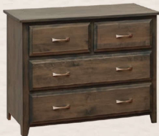
#115 HA • Changing Dresser 42" w x 20" d x 33¼" h Available in all styles